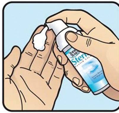
Figure 2. Use of Sterilid, a novel lid hygiene foam

Clinical reports have observed clearer and thinner oils with omega-3 treatment. 8 With an improved supply of omega-3s, the oils produced by the meibomian glands flow better and therefore create a better